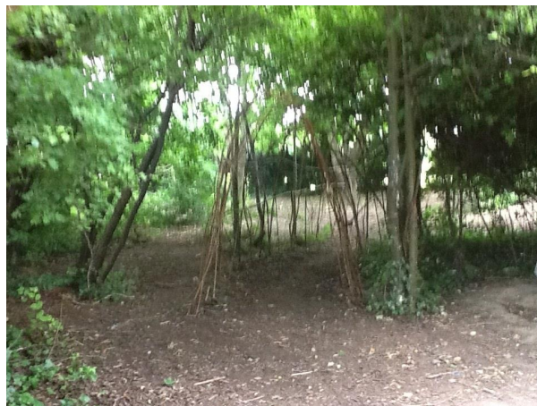
2 - Our Forest School

Supporting children to develop their emotional well-being and emotional vocabulary through working closely with teachers, InCo, Deputies and Headteachers.