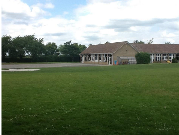
6 - Our school and grounds