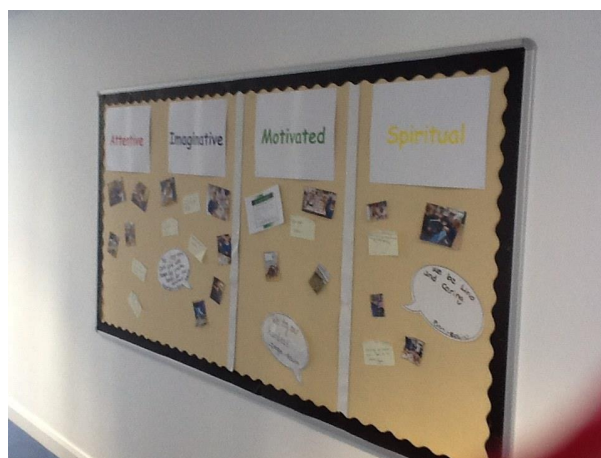
4 - We are imaginative, motivated, spiritual and attentive