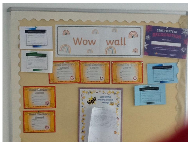
5 - We celebrate success