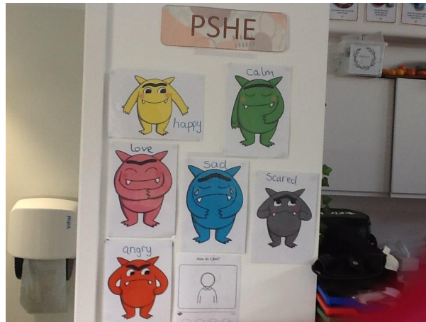
3 - Reception work on emotional well being