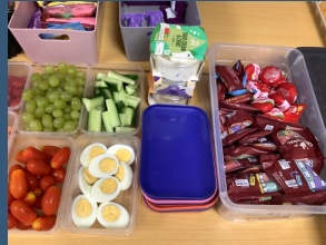
Tomatoes, cucumber, Eggs and dips