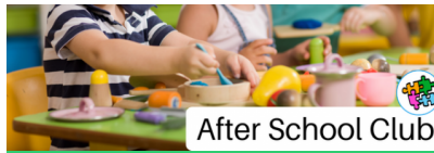
After School Club

Children are given a variety of cereals, Toast, crumpets and coming soon boiled eggs or scrambled eggs and toast, occasionally we have croissants or pastries as a treat