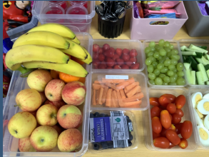
Plenty of fresh Fruit on offer

We are dedicated to promoting healthy eating and choices. If you have any ideas of what you would like to see on offer for your children please message me :)"