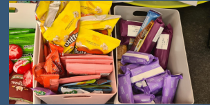
Popcorn dried fruits and yes occasionally a chocolate cake or biscuit